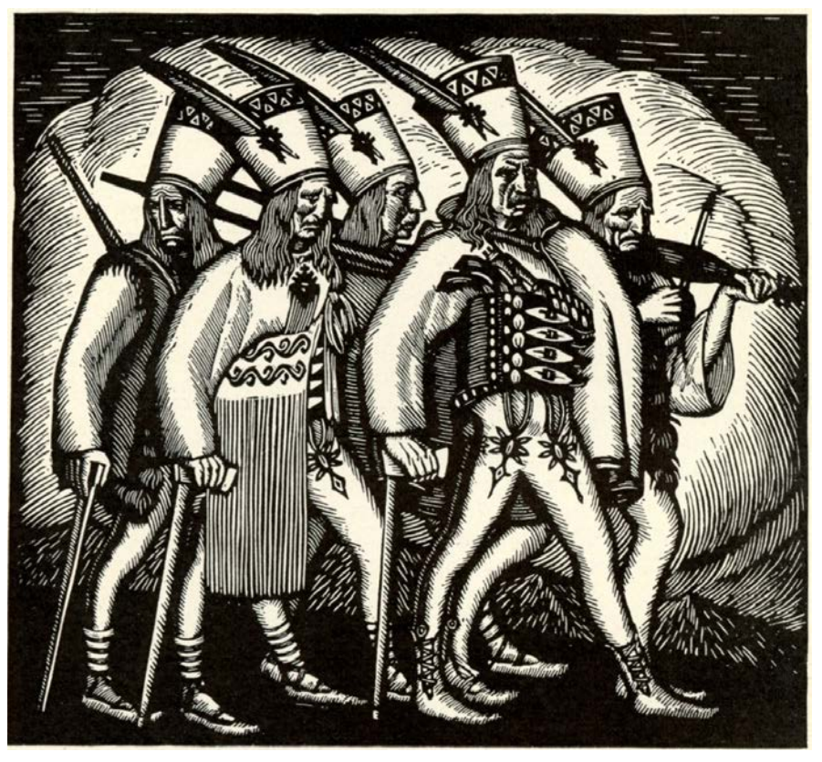
Janosik and His Band of Outlaws, by W. Skoczylas

These programs are of great genealogical use, as they document who were in attendance at a given function, and possibly the social status of those people attending. Also exemplified were the cause or causes which the affair was to benefit. Committee after committee listed names of both Poles and non-Poles who worked together to create a successful night of celebration, culture, and camaraderie. Location, music, and programs for entertainment were paramount in producing not only a successful benefit evening, but one of style and class, reminiscent of the szlachta of Poland and their estates. This, of course, was more than just a dance at